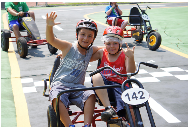
Petal Power Go Carts