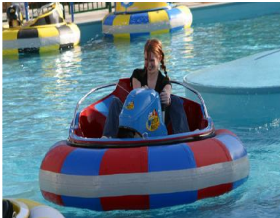
Adult Bumper Boats