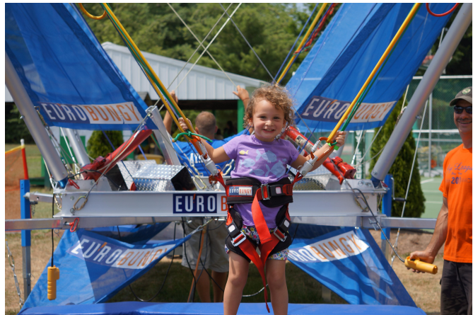
4 Person Euro Bouncer Trampoline